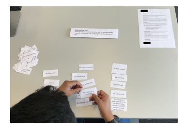
Figure 1: A participant sorting cards.