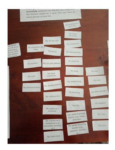
Figure 2: Set of sorted cards by a participant.

Table 1: Cards (features), example biometric technology, and citation. For this study, we only tested cards 1-32 (plus "My signature").