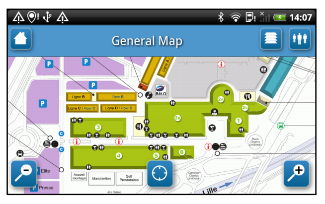
Figure 1. The general map, zoomed in 2x to display the fair's main halls.

A mobile application was developed specifically for the Paris Air Show by Insiteo, a company specialized in indoor navigation solutions. The functionality included an overview map of all halls and outdoor spaces (see Figure 1), several hall-specific maps of the fair (see Figure 2), a graphical visualization of the user's current position, graphical visualizations of the current locations of people who share their position with the application (the