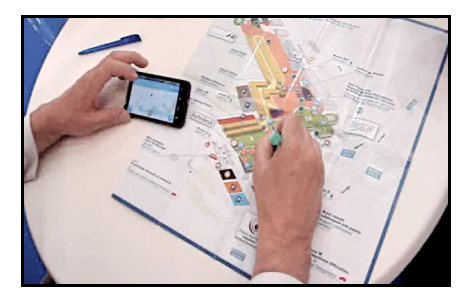
Figure 4. A participant performing exercise 3c, drawing the location of a stand in another hall on the paper map.

The last exercise, task 3c (on the paper map, put a mark where you think the stand is located) was performed best. Nobody scored less than 2.5, five scored between 4 and 4.5, and five scored the maximum score of 5. A participant performing this exercise is shown in Figure 4.