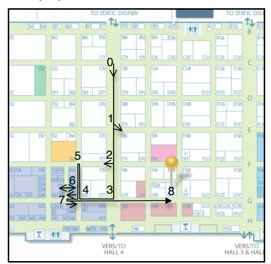
Figure 5. Walking route taken by participant P9, from start (0) to destination (8). Open arrows depict pointing actions.

where they are situated, right? Ok. So what I'm saying is I should be walking this way (points straight). And this pinpoint, in my head, it should be in front of me, right, because it's in front of me." Next, she focused on the screen rather than the environment. At t=2:10, she turned the phone around several times (180 degrees, 0 degrees, 90 degrees, 180 degrees, 90 degrees), commenting: "I'm playing around, just changing it. I just wanted to see how it would situate me if I turned the phone. Because I don't necessarily have to hold it this way to tell me where I am. So if I turn it anyway, it should still tell me where I'm situated."