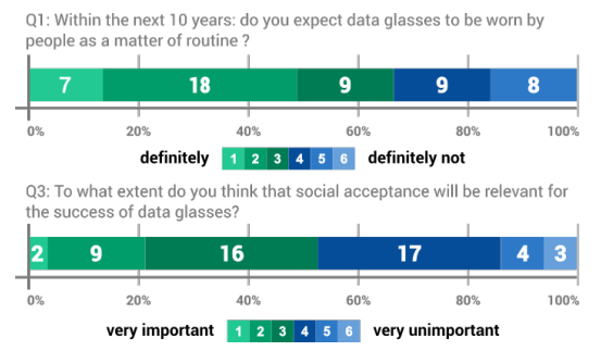
Figure 1. Answers to Q1 (top, Median=3, \sigma =1.3) and Q3 (bottom, Median=3, \sigma =1.2), measured on 6-pt. Likert Scales.

Prognoses The majority of participants estimate data glasses to be worn as a matter of routine within the next 10 years (Median=3, \sigma =1.3); also shown in Figure 1. While participants value the advantage of hands-free interaction (n=5), situated information access (n=7), as well as natural interaction (n=4) they also name both technological and societal issues that would have to be solved before wide adoption becomes possible. Particularly, opinions diverge regarding the pervasiveness of adoption and prerequisites that would have to be met. Participants expect data glasses to be successful in specialised application areas (n=18), such as the work place (n=15) or sports (n=4). Opinions were divided whether adoption by consumers for casual usage is likely (n=6) or unlikely (n=7).